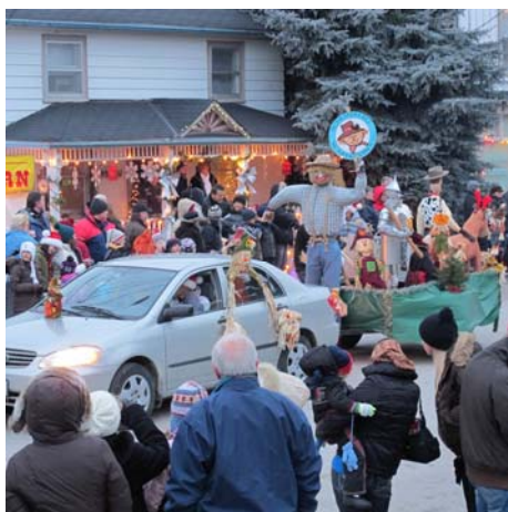
Santa Claus Parade