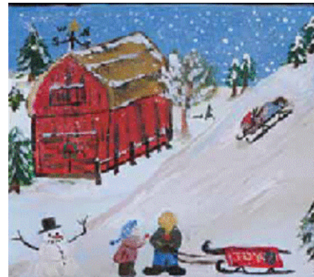
Traditional collectors poster