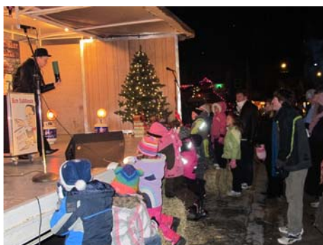
Entertainers on Main Street