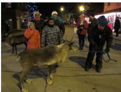
Santa's real LIVE reindeer