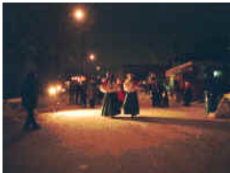
Costumed carollers entertain