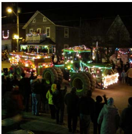
Farmers' Parade of Lights