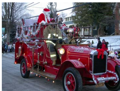
Santa Claus Parade